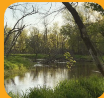
J Clark Saylor Refuge