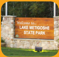
Lake Metigoshe State Park