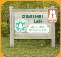
Turtle Mountain State Forest